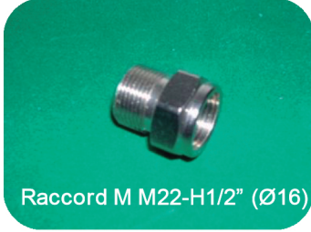
❖ Ref: R002

Multilayer tube TWIN-PIPE with sheathing included in different tubes (One or Two pipe) (back-and-return) in the same coil.