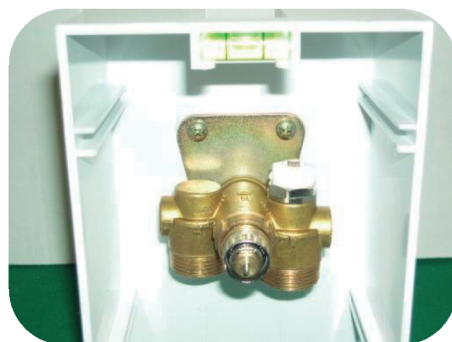
TP 3001 (Ø 3/4)

Independent control valve, allows to choose the temperature in different rooms.