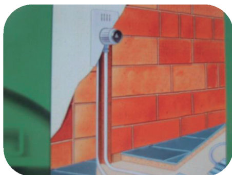
TP 3000 (M22) Ø16

Independent control valve, allows to choose the temperature in different rooms.